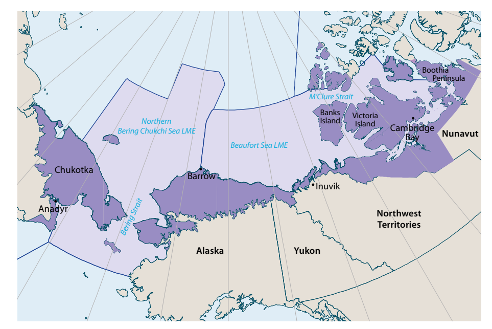
Figure 2: The BCB study area

The tundra ecosystems have evolved in response to low temperatures, little precipitation, nutrient limitations, short