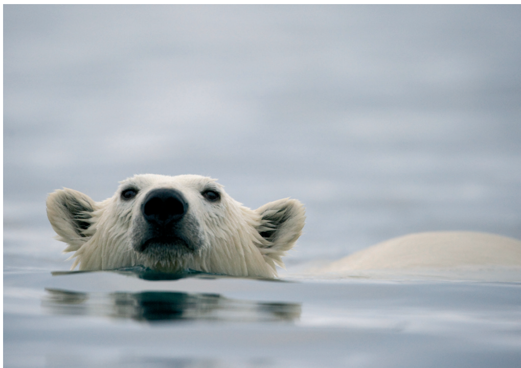
Swimming Polar Bear, Svalbard

use in the Arctic region) will change vegetation cover, affect environmental reservoirs, and, in turn, modify secondary emissions of POPs. Deposition of POPs from the atmosphere into foliage and subsequent formation of long-term soil reservoirs (Wania and McLachlan, 2001) may be affected by climate-change-induced modification of land use. For instance, increased proportions of leaf-bearing plants in Arctic regions may promote this 'forest pump effect' from atmosphere to soil.