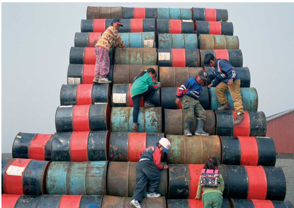
Inuit children play on a pile of empty oil drums. Moriussaq, nw Greenland

increased disease risk caused by climate change and immunosuppressive effects of POPs may have serious impacts at the population level. Thus, toxic or endocrine effects may directly affect fecundity and/or survival, and therefore have a direct consequence on population size. Effects at the population level can be manifested as bottom-up or top-down stress in ecosystems, causing severe changes in biodiversity and ecosystem functioning.