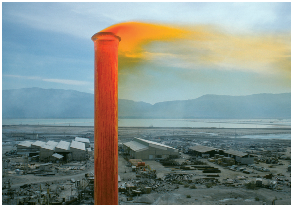
Bromine chemical fumes above a refinery at Sidom, Israel

2005. Eleven of the twelve warmest years occurred between 1995 and 2006. However, the warming has been neither steady nor the same in different seasons or at different locations. Seasonally, warming has been slightly greater in the Northern Hemisphere and especially in the Arctic.