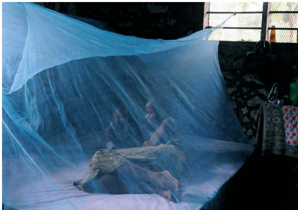
Mother and baby protected by mosquito net, Kenya