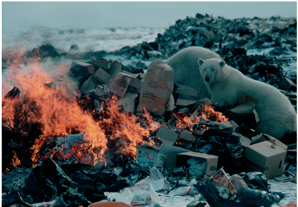
Polar Bears at Garbage Dump, Churchill, Canada

Chapter 3 contains information on how climate change is expected to alter concentrations in environmental exposure media (e.g., air, water, soils, sediments and vegetation). That discussion will not be repeated here, but it is worth emphasizing that changes in POPs transport and fate as a result of climate change will have direct consequences for exposure of wildlife and humans to POPs. Because human and wildlife exposure to most POPs is through environmental media, a predicted change in external POP concentrations will cause an associated change in internal concentrations in wildlife species and human populations.