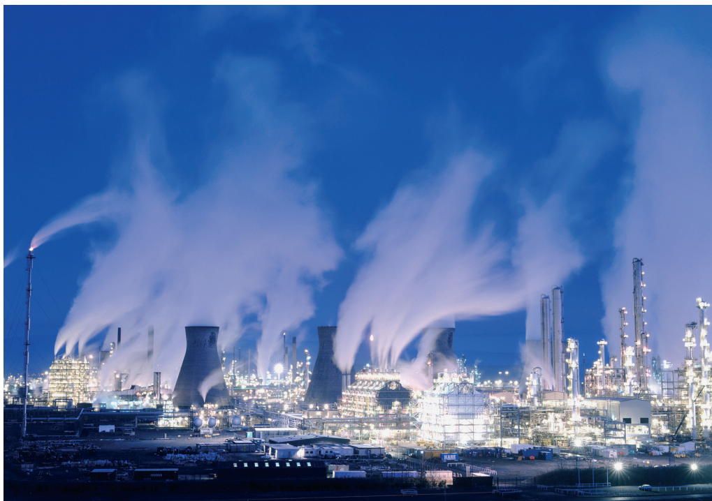
Petrochemical plant, Scotland, UK

systems are the most important technical and economical measure to increase fuel efficiency (EC, 2006a,b). This measure will also contribute to reductions in unintentionally produced POPs emissions.