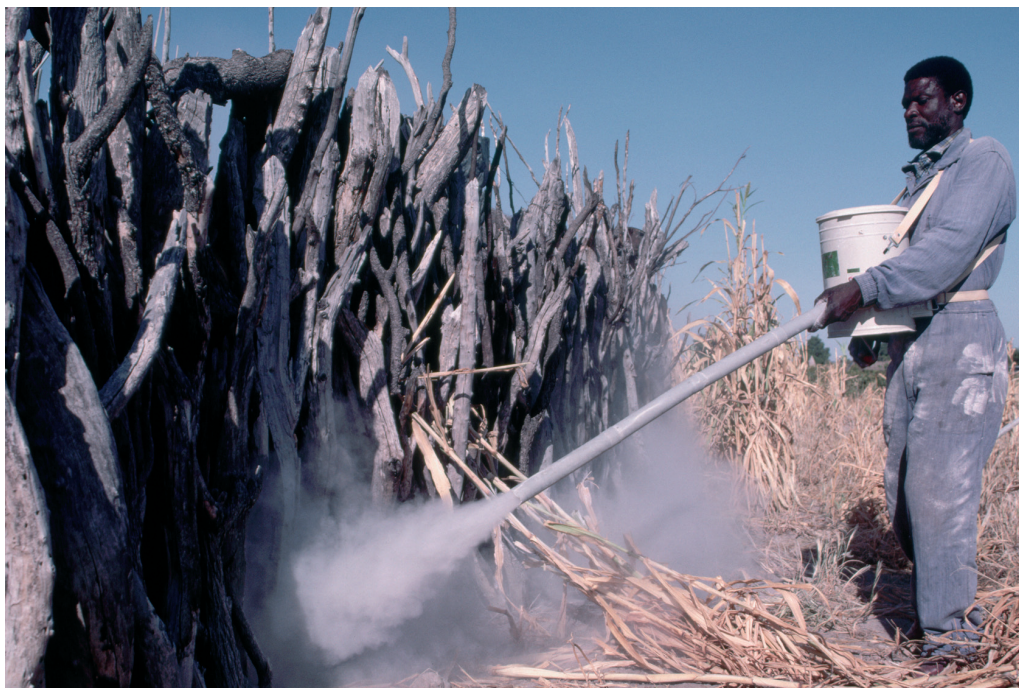
DDT spraying in Namibia

human health and the environment; this evaluation is based on several types of information, one of which is comparable and consistent monitoring data on the presence of POPs in the environment and in humans. The Global Monitoring Plan (GMP) for POPs, which has been put in place under the Convention, is a key component of the effectiveness evaluation and provides a harmonized framework to identify changes in levels of POPs over time, as well as information on their regional and global environmental transport.