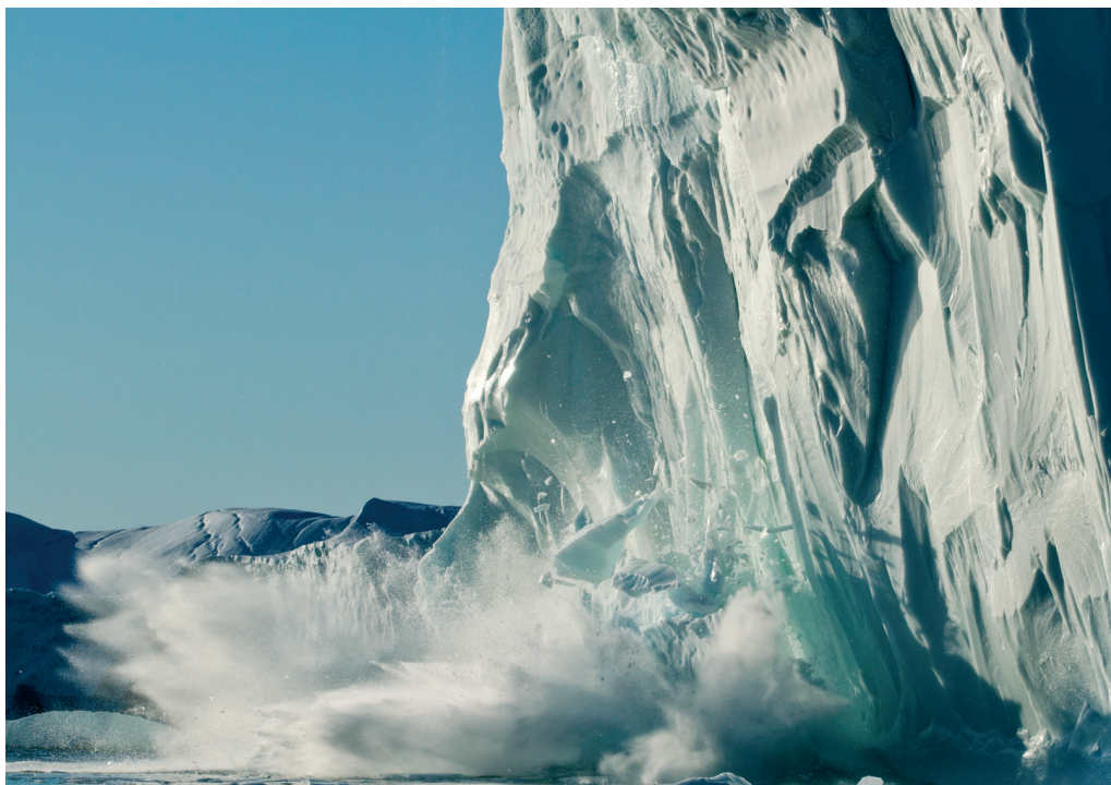
Calving Iceberg, Disko Bay, Greenland

as reported by the Intergovernmental Panel on Climate Change (IPCC, 2007). A main impact of the changes in precipitation on POPs concentrations is caused by changes in wet deposition. Another factor is the effect of changing precipitation on soil moisture and microbial communities in the soil that biodegrade POPs.